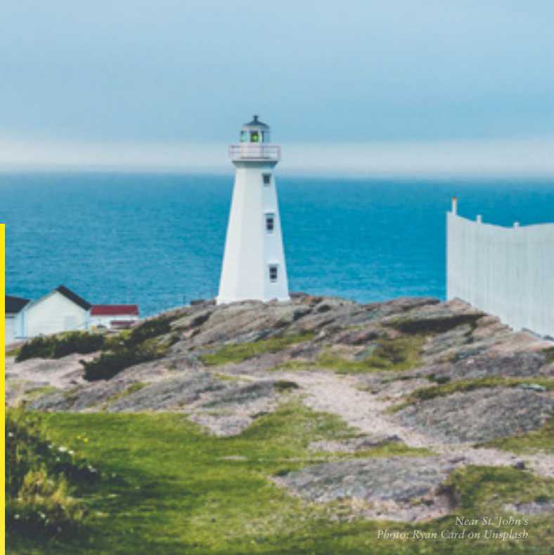
Near St. John's